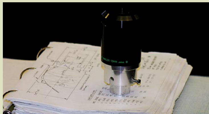
ASTRONOMY: MICHAEL E. BAKICH

AL NAGLER'S DESIGN NOTEBOOK sits open to the page showing the original drawing and specifications for the first Nagler eyepiece — the 13mm — rests atop the notebook.