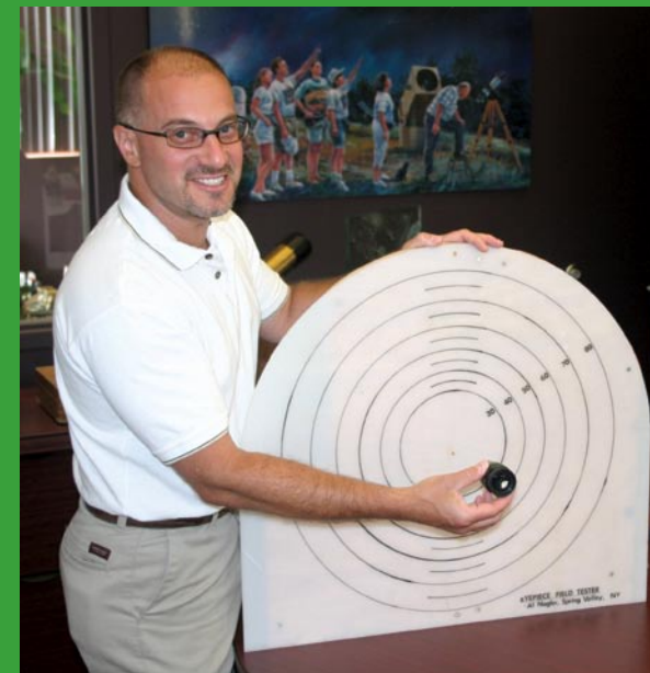
ASTRONOMY: MICHAEL E. BAKICH

CHANGE IS GOOD. These diagrams show the changes in optical layout between Tele Vue's Type 1 and Type 2 eyepieces.