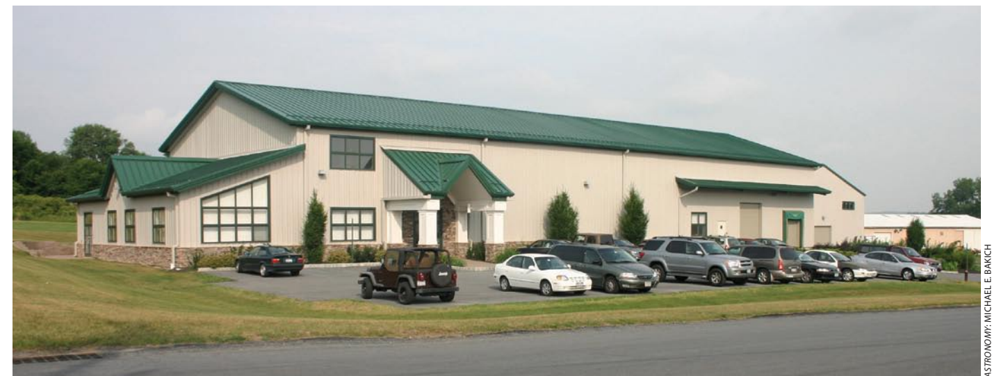
ASTRONOMY: MICHAEL E. BAKICH

AL NAGLER'S DESIGN NOTEBOOK sits open to the page showing the original drawing and specifications for the first Nagler eyepiece — the 13mm — rests atop the notebook.